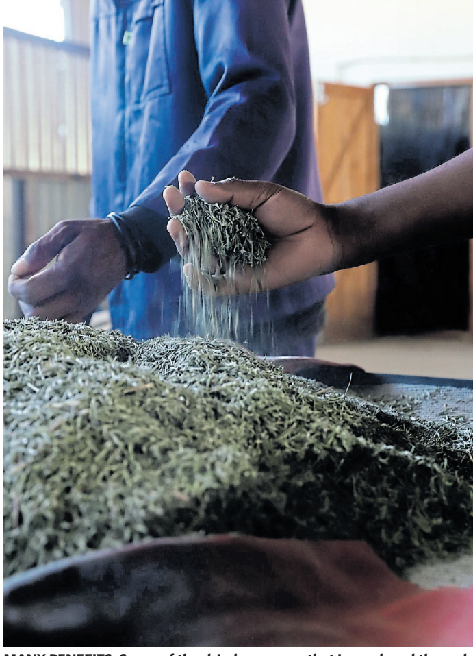
MANY BENEFITS: Some of the dried rosemary that is produced through Qobo Qobo Essential Oils

done." Run in partnership with the SA Breweries Foundation and other corporates such as Old Mutual and Nedbank, Qobo